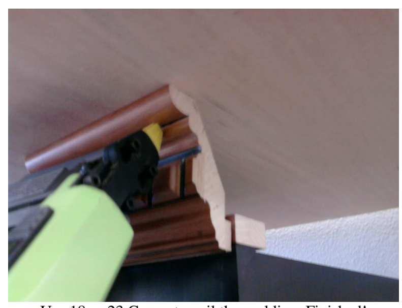
Use 18 or 23 Gauge to nail the molding. Finished!