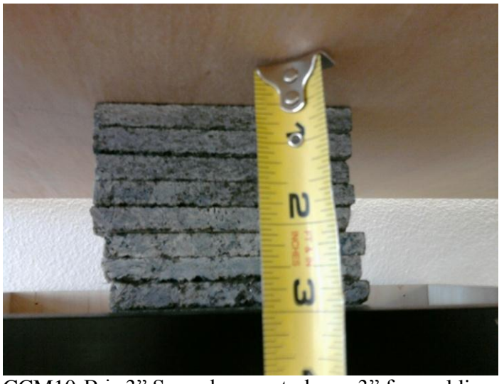
CCM10-B is 3" So make sure to leave 3" for molding.