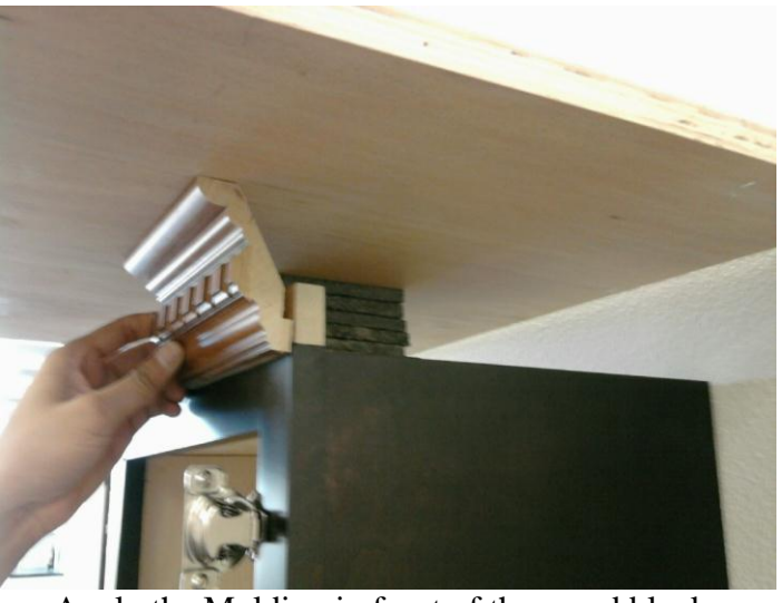
Apply the Molding in front of the wood block