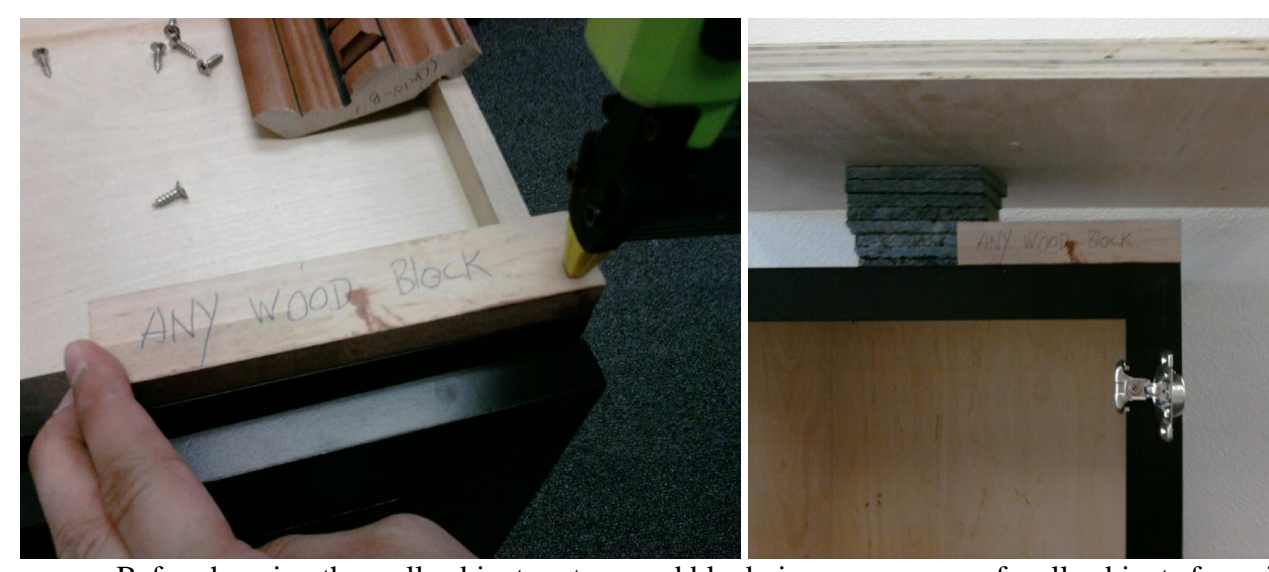
Before hanging the wall cabinet, put a wood block in every corner of wall cabinets for nailing purpose.